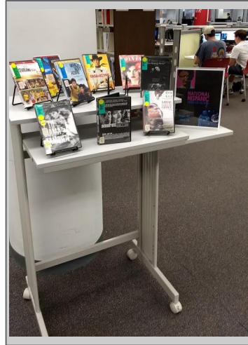
From this hopefully!