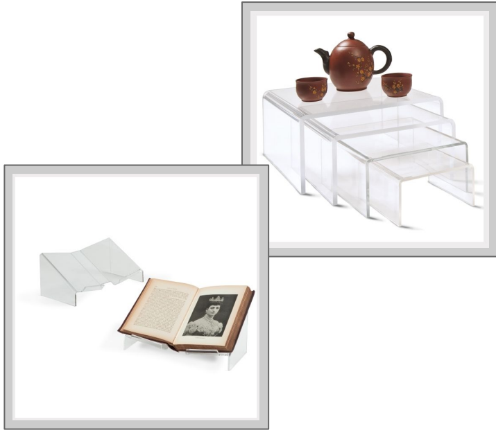
Archival Display Materials with co-worker